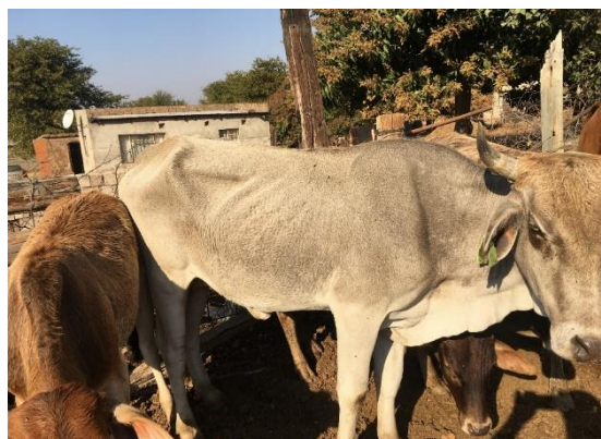
Undernourished cow in Limpopo province during dry season.

Simplified conceptual model indicating key issues for livestock farmers and major interactions between rangeland degradation and feed gaps. Note that not all interactions are shown, e.g., bush encroachment has several drivers including climate change and overgrazing.